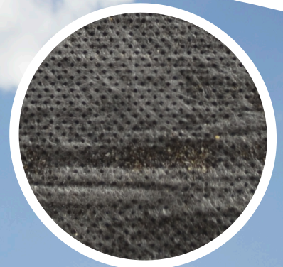
Upper Surface: PP Fleece